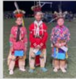
Jr. Boys Straight