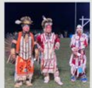
Sr. Men's Traditional & Grass