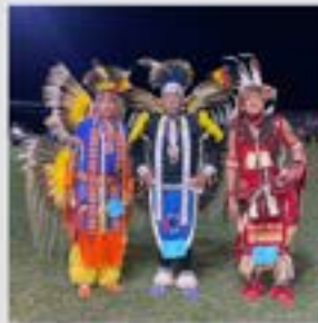
Golden Age Men