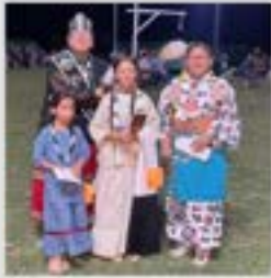
Jr. Girls Cloth