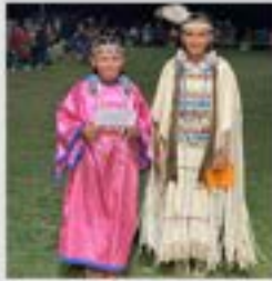
Jr. Girls Buckskin