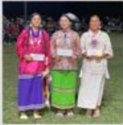
Teen Girls Cloth