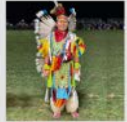
Teen Boys Fancy