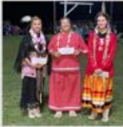
Teen Girls Buckskin