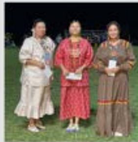
Sr. Women's Cloth