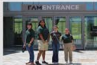
Summer Interns at FAM in OKC Field Trip