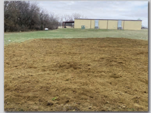
Kaá n ze Íe Garden Tilled and ready to plant.

https://kanzalearningsite.wixsite.com/website