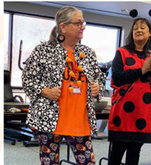
Exec Director & Injury Prevention