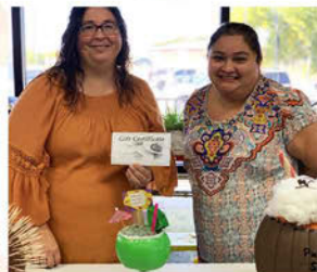
Administration Receptionists Carving