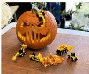
Transportation Dept. Carving