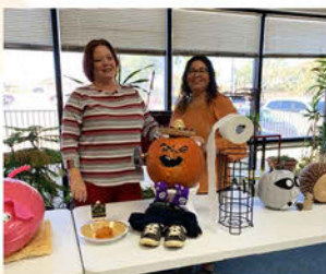
Tag Office Pumpkin Carving