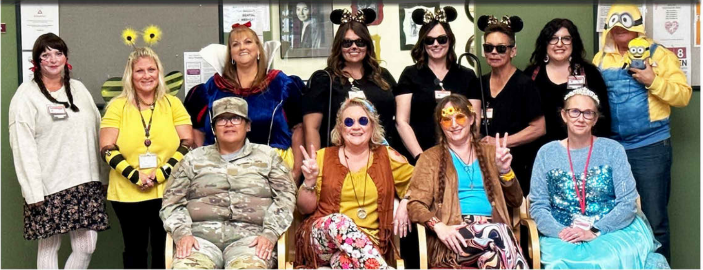
Our wonderful Kanza Clinic staff in thier awesome costumes.

The Kaw Nation had a spooktacular Halloween celebration this year! Children from Childcare Development came to trick-or-treat at the Kaw Nation administration offices, where they received plenty of treats and even got to show off their costumes.