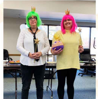
Accounting/Purchasing Fairy Duo