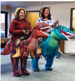
Grants Dept. Dinosaurs