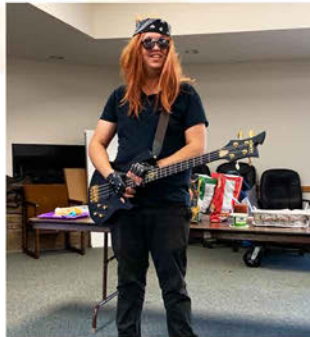
ICW Dept. Rockstar