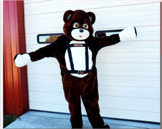
Our Car Seat Safety Mascot, Buckle Bear