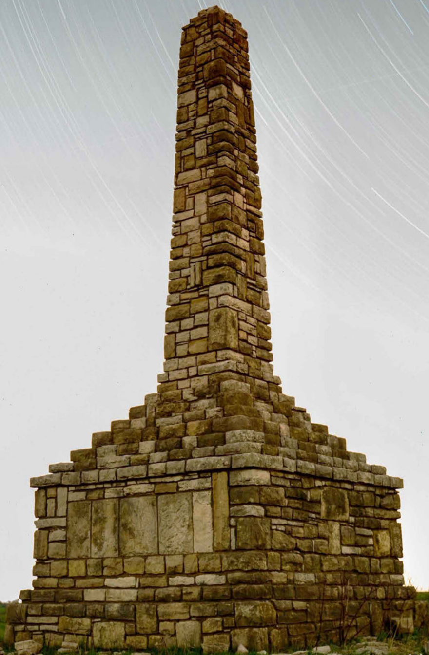
Monument of The Unknown Kanza Warrior Allegawaho Park - Council Grove, Kansas