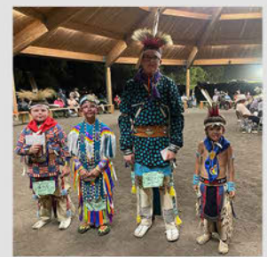
Jr Boy's Straight, Traditional, Grass, and Fancy