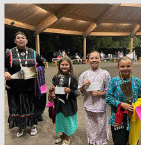
Jr Girl's Cloth