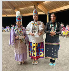
Adult Women's Cloth