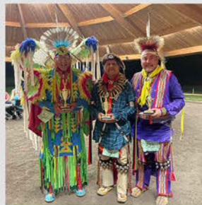
Golden Age Men