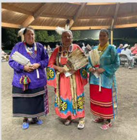
Golden Age Women